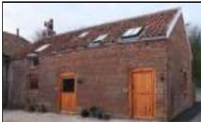
Brownridge Cottage sleeps 4 -6