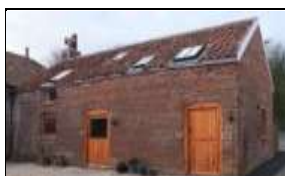
Brownridge Cottage sleeps 4 - 6