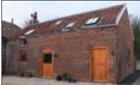
Brownridge Cottage sleeps 4 - 6