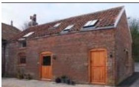
Brownridge Cottage sleeps 4 - 6

Any old fountain pens and related items - I collect them Mike 07976 204560 or 020 8942 0554