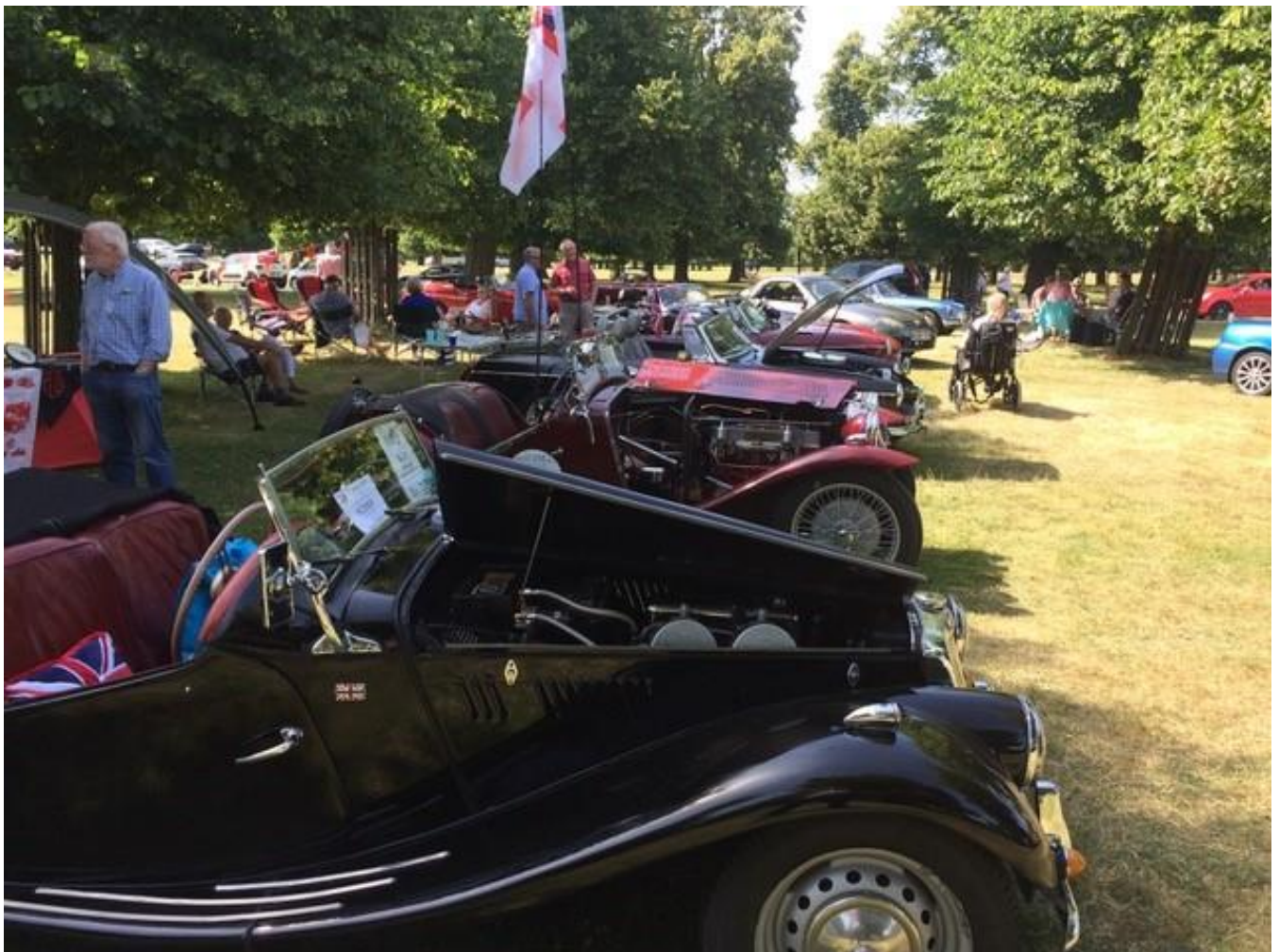
Epsom MGOC Club Stand at Hanworth Classic Car Show June 2018