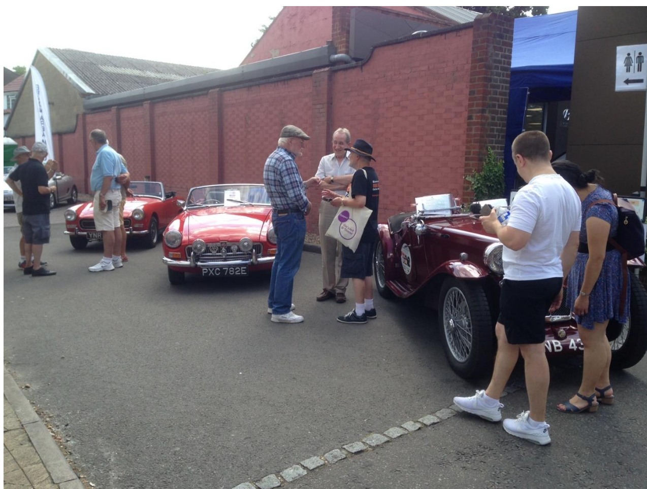
Epsom MGOC members attending The Belmont festival on Sunday 8 th July 2018