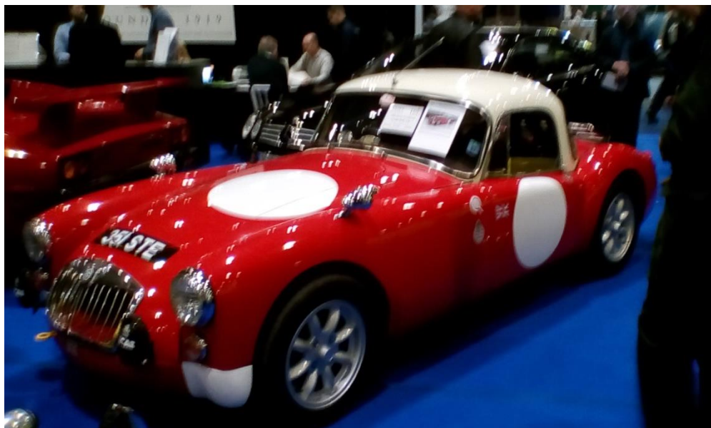
1960 MGA Historic Rally Car seen at London Classic Car Show 14 th February in Coys Auction