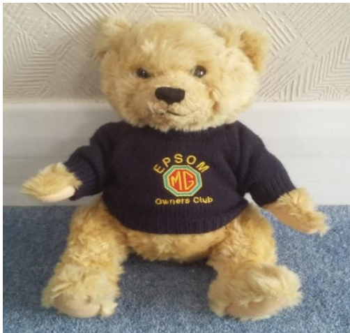
Mumbles Teddy Bear in all his Glory!