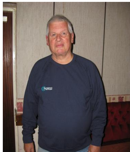
Medium Weight Sweatshirt for Epsom MGO

ORDER FORM FOR EPSOM MG OWNERS' CLOTHING: POLO SHIRT £15; HOODIE £25; SWEATSHIRTS £17.50 (Either)