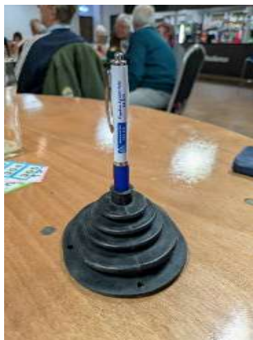
And a useful pen holder purchased at the auction!